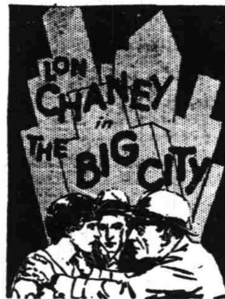
The Throbbing, thrilling Life of the Underworld