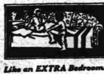
Like an EXTRA Bedroom!

Biltwell DUAL-USE Davenports in the Sale