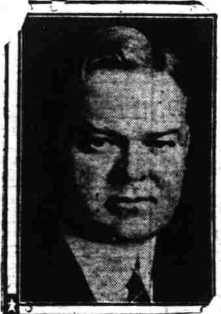
Herbert Hoover for President