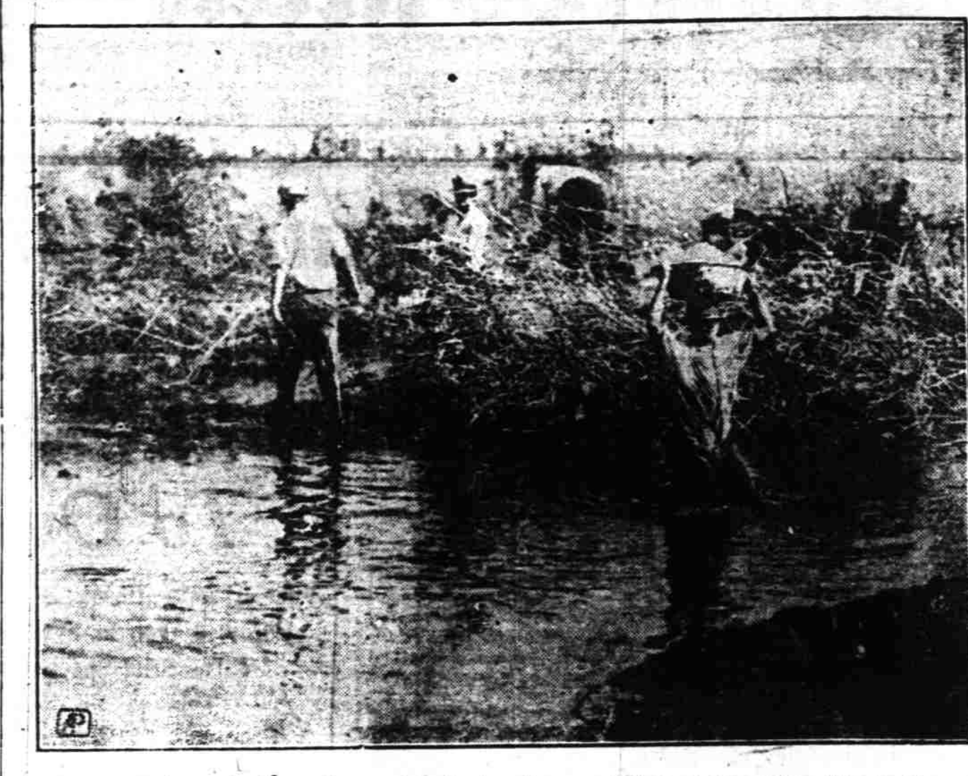
After their homes had been desroyed by the hurricane and flood at Okeechobee City, in the area of the great Florida lake, many of the residents sa lyaged what they could from the wreckage.