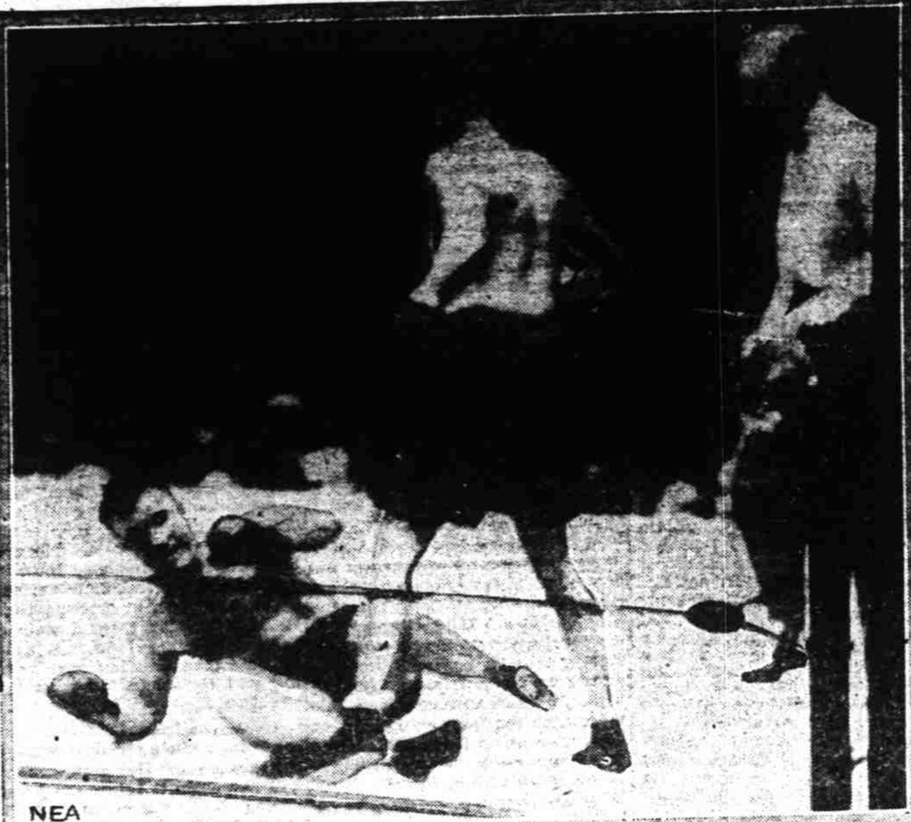
Tunney's supremacy over Heeney was definitely settled in the fourth round, when after Heeney's game attack in the third, the champion floored him. This picture of the fall, snapped by the NEA Service cameraman, was rushed to San Francisco by telephone, and sent to The Statesman by air mail.