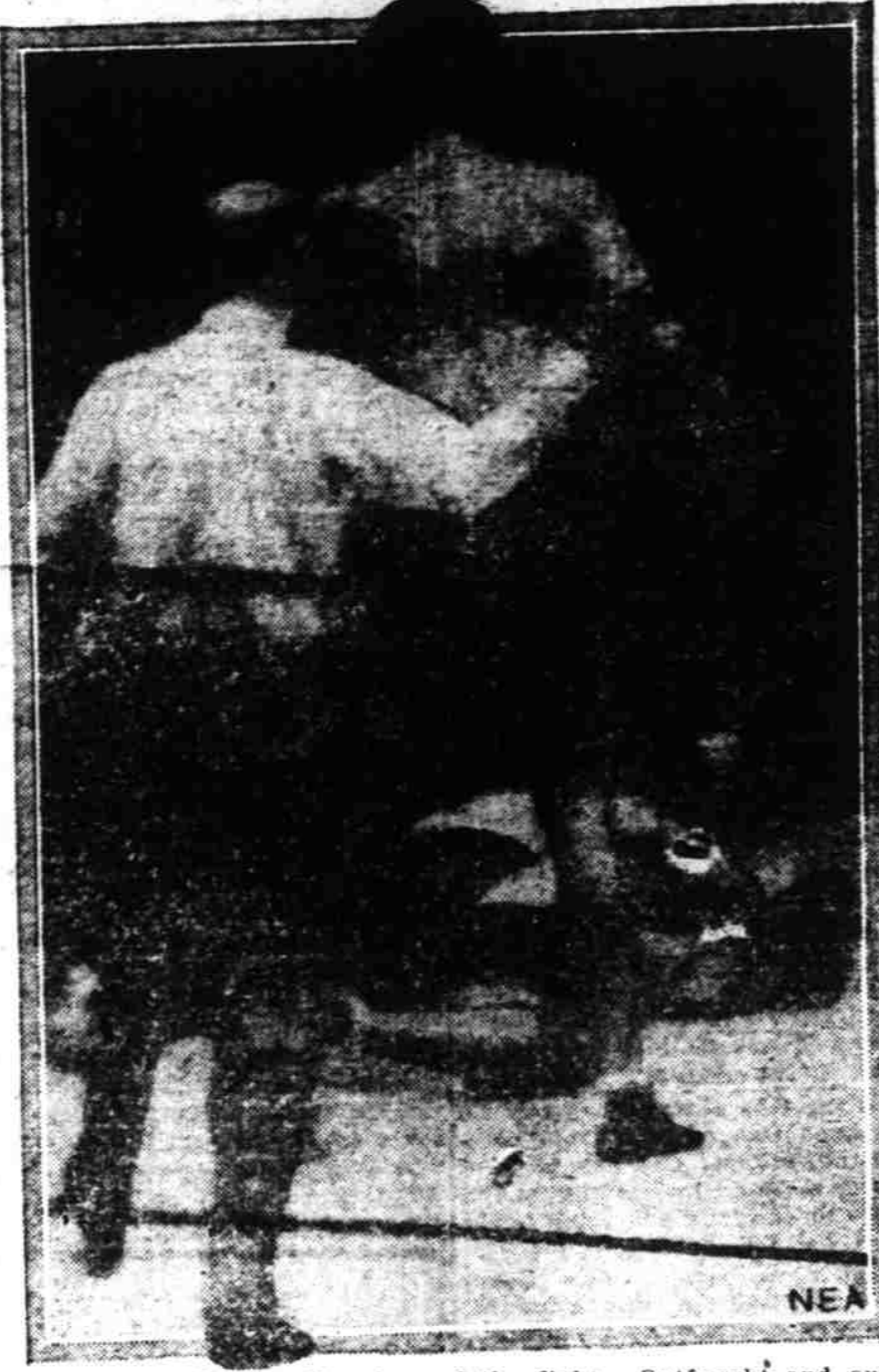
Here, really, was the close of the fight. Outfought and outsmarted—but never outgamed—the battered, bleeding, bewildered New Zealander is shown, rolling unconscious across the ring in the 10th round, out and saved from a 10 count by the bell ending the round.