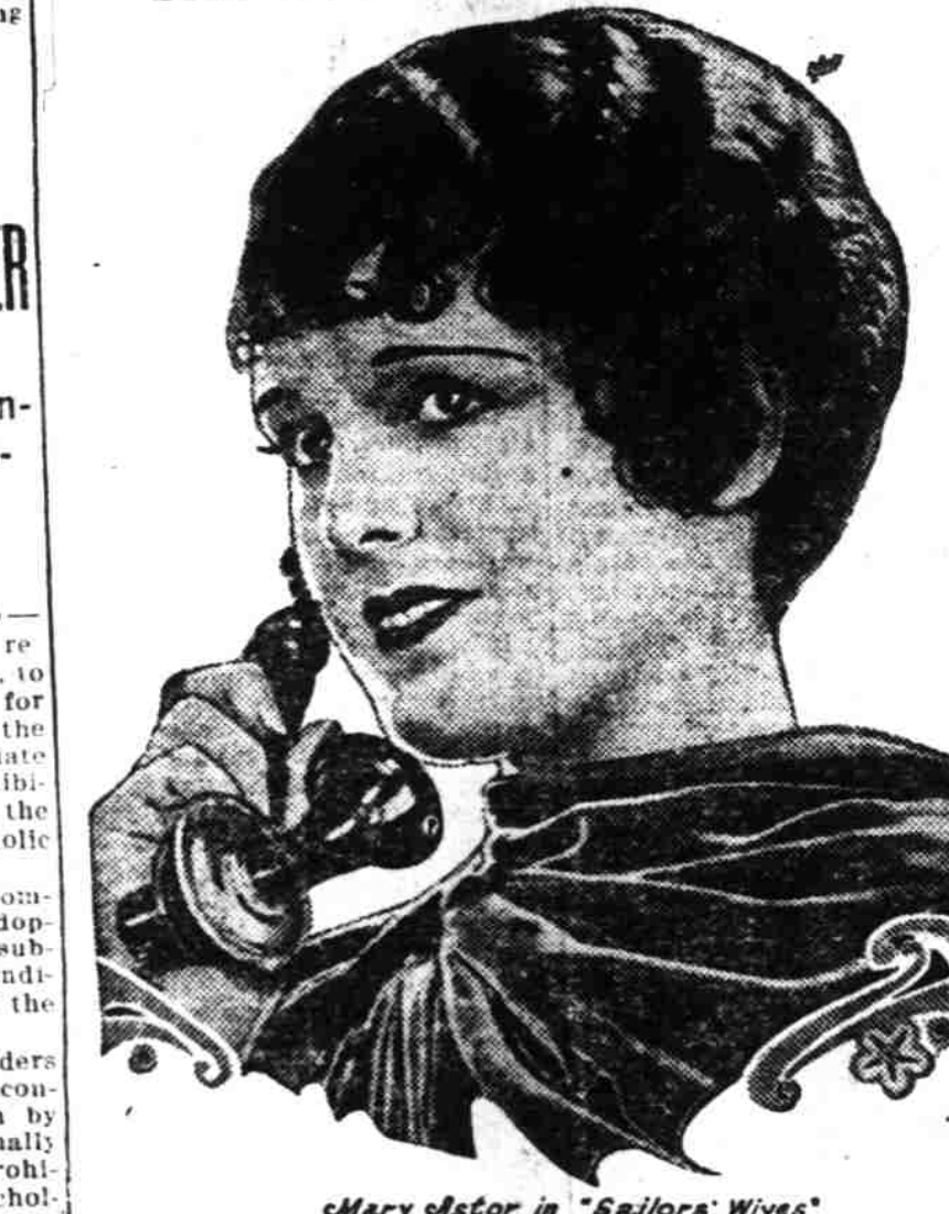
Mary Astor in "Sailors' Wives"