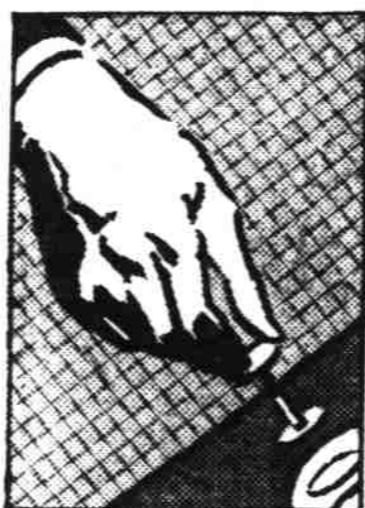
In starting, Shell 400 requires less choke than "wet" gas but can stand more without causing thinning

Fill with Shell 400 today; use it regularly. It costs no more than ordinary gasoline.