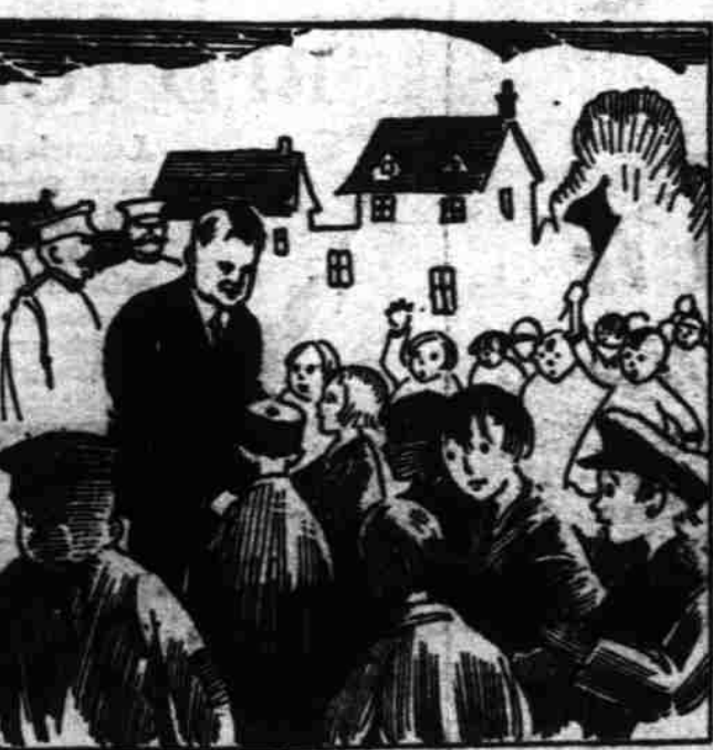
2. On a visit to Poland, 60,000 children paid him a personal tribute of thanks and praise.