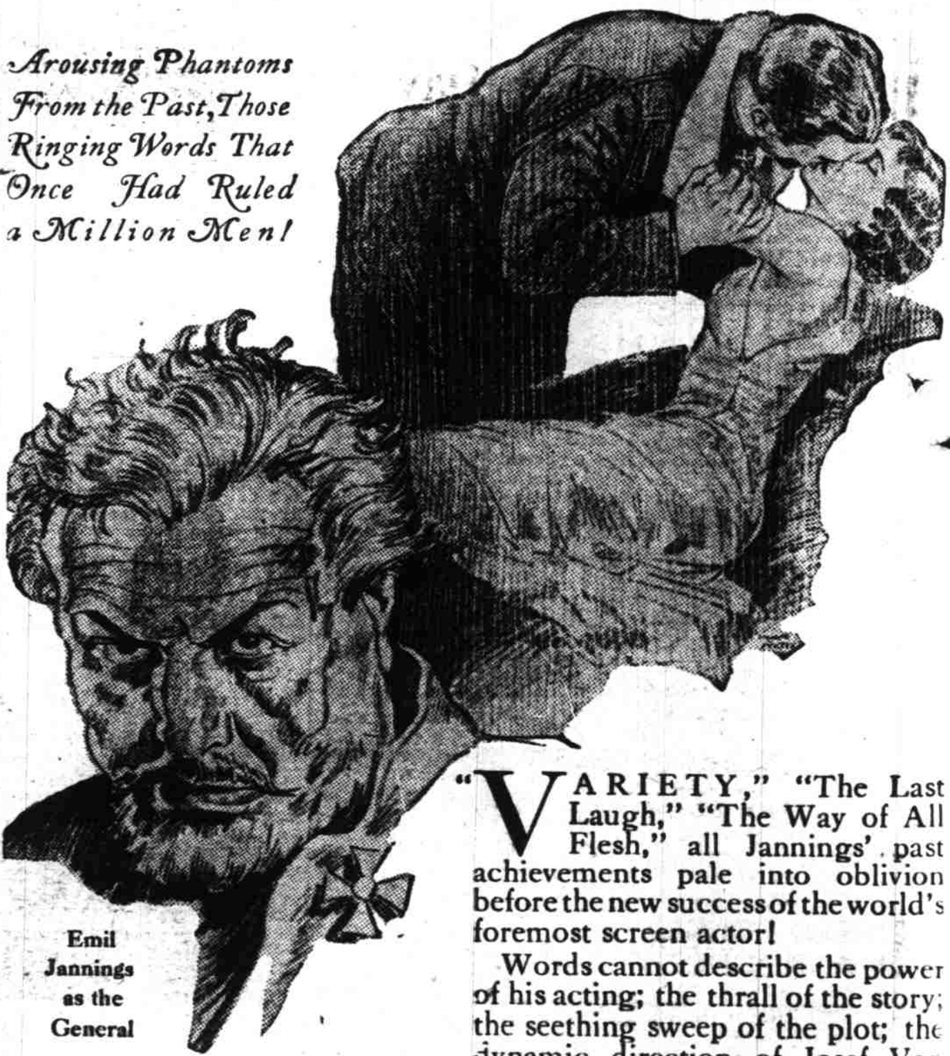
Emil Jannings as the General

Arousing Phantoms From the Past, Those Ringing Words That Once Had Ruled a Million Men!