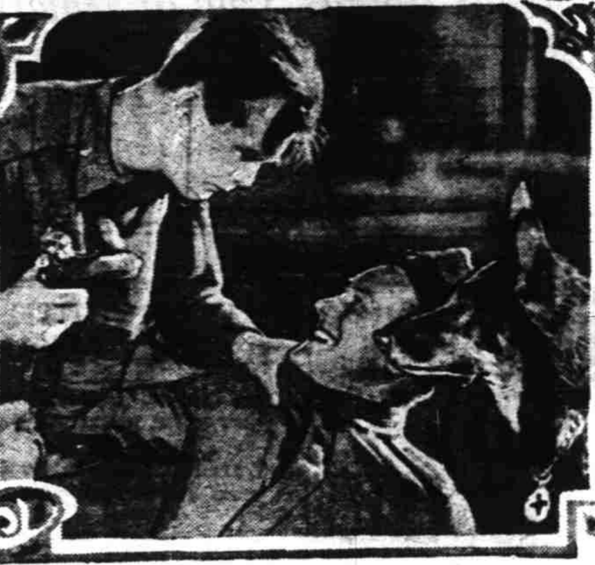
Rin Tin Tin