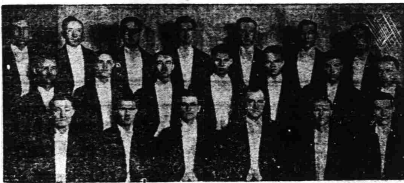
Club to sing at Capitol theater Saturday afternoon and evening.

One of the outstanding collegiate musical organizations on the Pacific Coast, will open its annual, spring tour of various cities of the state, when they appear at Bligh's Capitol for one day only on next Saturday, March 17th, playing three shows, afternoon and two at night.