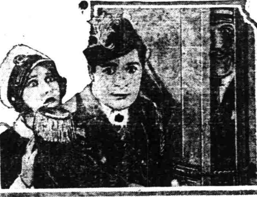
Scene from "Sailor Izzy Murphy" at Warner Bros. Productions

other boat explaining their sad plight. A rescue party boards the Esmeralda and succeeds in imprisoning the crew of lunatics in the cabin. "Orchid Joe" locks himself in the engine room with Izzy and Marie, intending to blow up the boilers. Izzy, forced at the point of a gun to put on a heavy overcoat and shovel coal, foils the plan by overpowering the maniac before he can use the revolver.