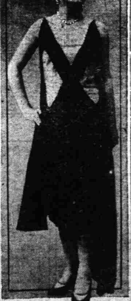
Over a bodice of pink sequins Lanvin introduces rich black velvet in this evening gown. A graceful train falls from the side.