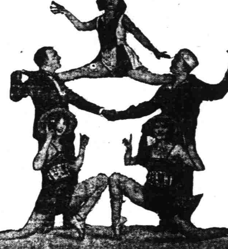
Bligh's Capitol Today