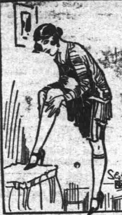
Wasteful girls; they buy $5 worth of hose and roll 'em down to $2.50 worth.