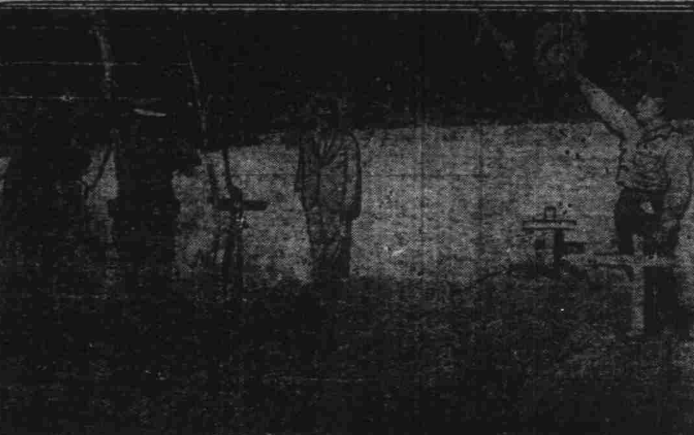
This photo, rushed from Mexico by airplane to Central Press, shows the execution of General Francisco R. Gomez, candidate for the Mexican presidency, by the bullets of a firing squad near his mountain retreat.