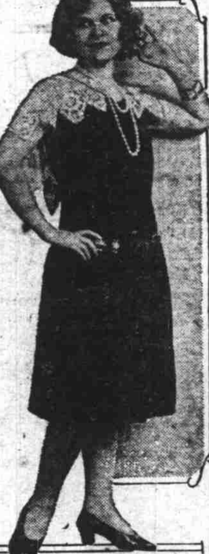
Reminiscent of the velvet suit of Little Lord Fauntleroy is this black velvet frock with handsome wide lace collar. Hope Hampton is the model.