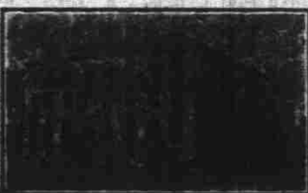
Y. M. C. A. BUILDING

Just to add one or two items—The value of Salem property alone is placed at over 33 Millions. We have more miles of Rural Telephone Lines than any city in the West of Equal Size. We also have the Highest Percentage of American Citizenship of any County in the West.