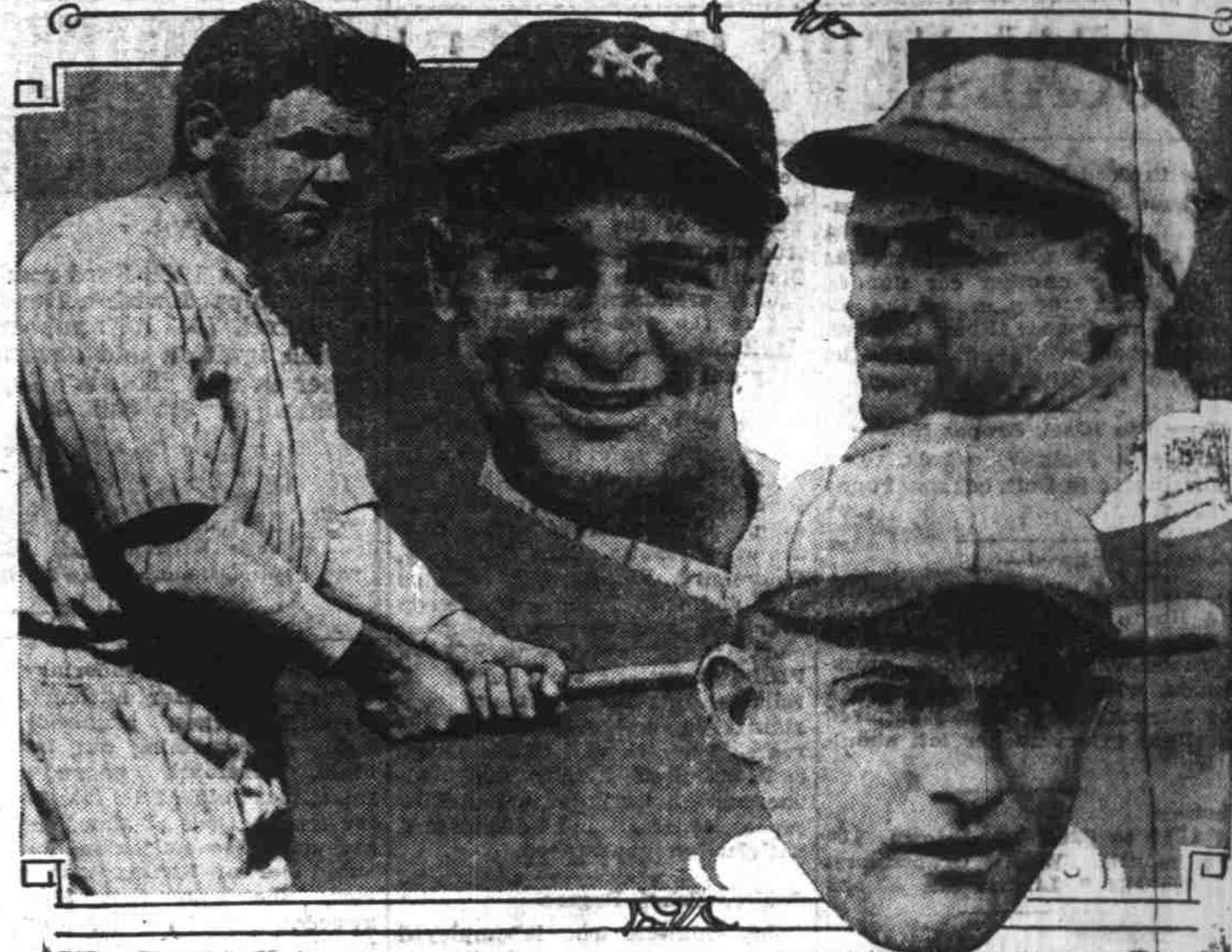
Only four major leaguers in history have cracked out 40 or more homers in a season. Here they are: Babe Ruth, Lou Gehrig, Cy Williams and Rogers Hornsby.