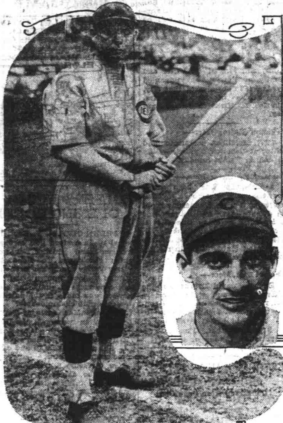
The poor showing of George Kelly (insert) who was acquired by Cincinnati for Eddie Roush (above) is blamed by many Cincinnati fans for contributing much to the downfall of the Reds in the current National league race.