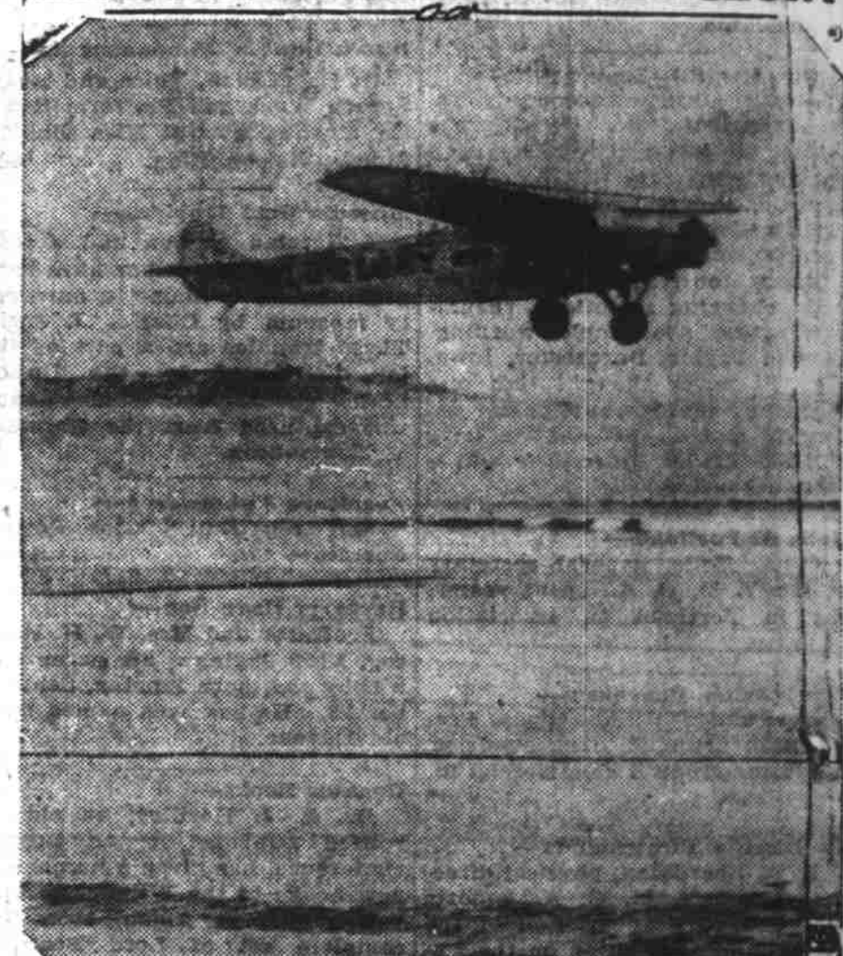
This is the last photo taken of Old Glory. It shows the plane rising from the sands of Old Orchard Beach, Me., taking out to sea on its fatal flight.