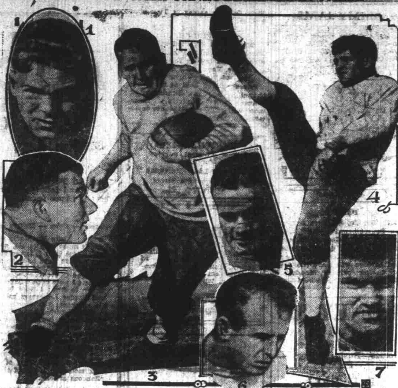
Seven Trojan hopefuls who may carry the griddle banner of the University of Southern California to greater glory this season. Coach Howard Jones is reported planning to change some of these back-field men into linemen in order to strengthen the Trojan forward wall.