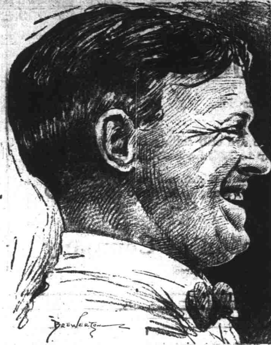
Bobby Jones, who repeated his victory of last year in the British Open championships, which was the first time a foreigner had taken this event.