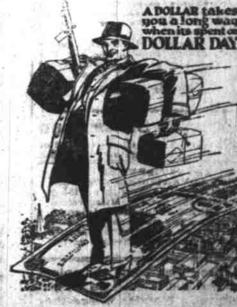
A DOLLAR takes you a long way when he's spent on DOLLAR DAY