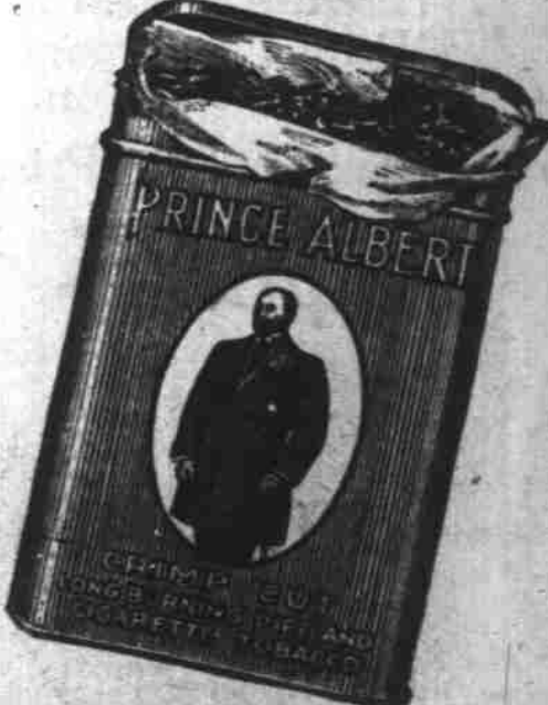
P. A. is sold everywhere in tidy red tins, pound and half-pound tin humidors, and pound crystal-glass humidors with sponge-moisture top. And always with every bit of bite and punch removed by the Prince Albert process.