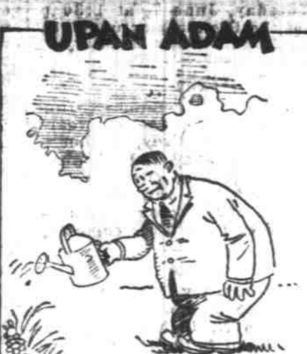
"A tin ear indicates that the wearer probably was knocked on his can at some time or other"