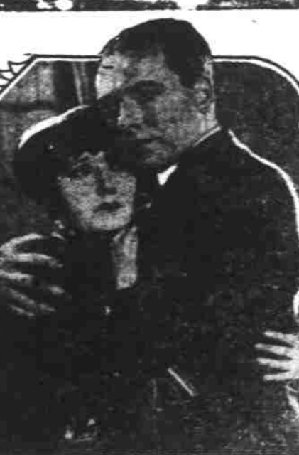
PAT O'MALLEY and MAE BUSCH in "THE PERCH OF THE DEVIL" A UNIVERSAL JEWEL PRODUCTION