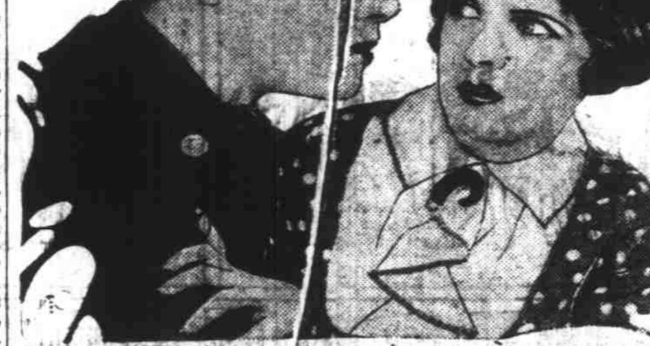
CHARLES RAY and MAY MAYO in "THE FIRE BRIGADE"