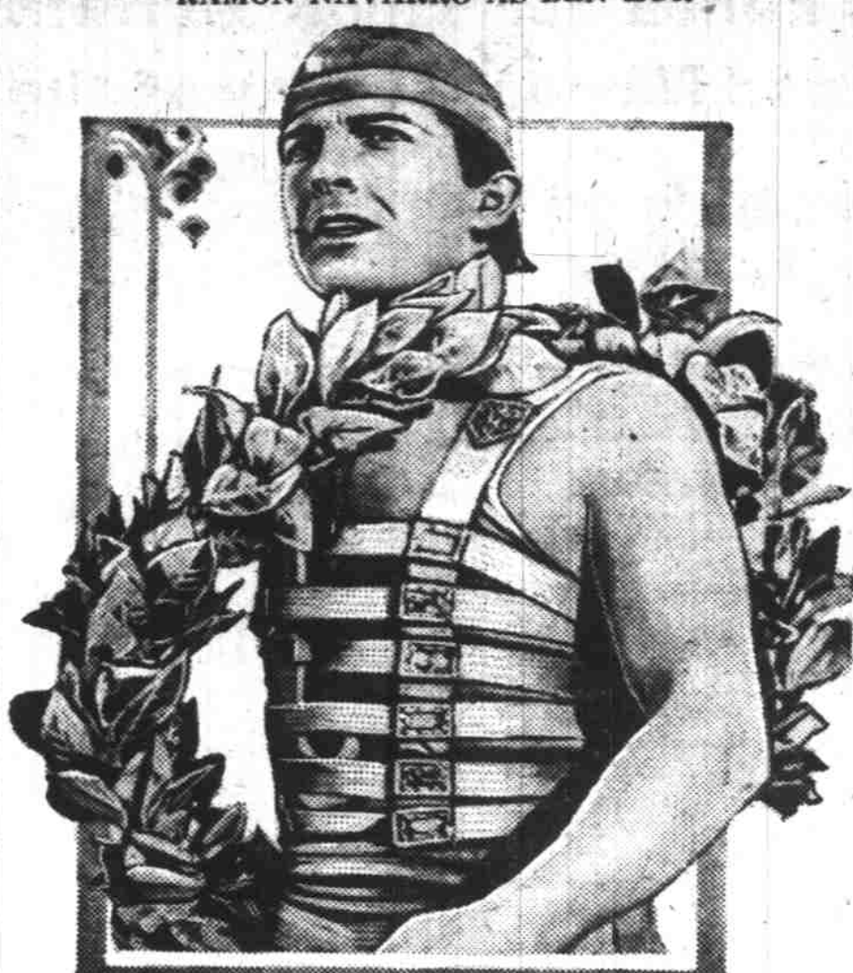
Oregon Theater May 1 and 2