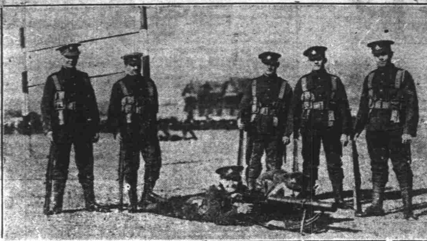
Photo-shows British marines' machine gun company in drill on the Shanghai, China, race course, which they took over and converted into a training camp.

the majority have enrolled in the new school of business thought which teaches that pleasant surroundings have a stimulating effect on workers in general.