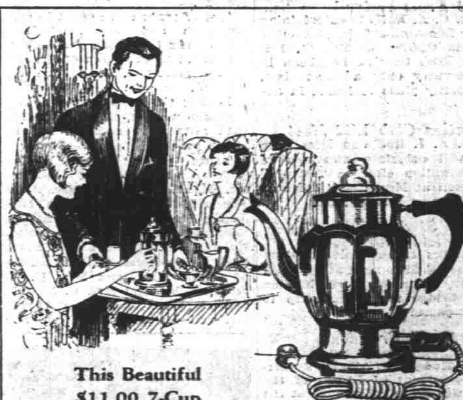
This Beautiful $11.00 7-Cup

Your Car Deserves SEIBERLINGS America's Finest Tire ZOSSEL'S TIRE SHOP 189 S. Commercial Tel. 471