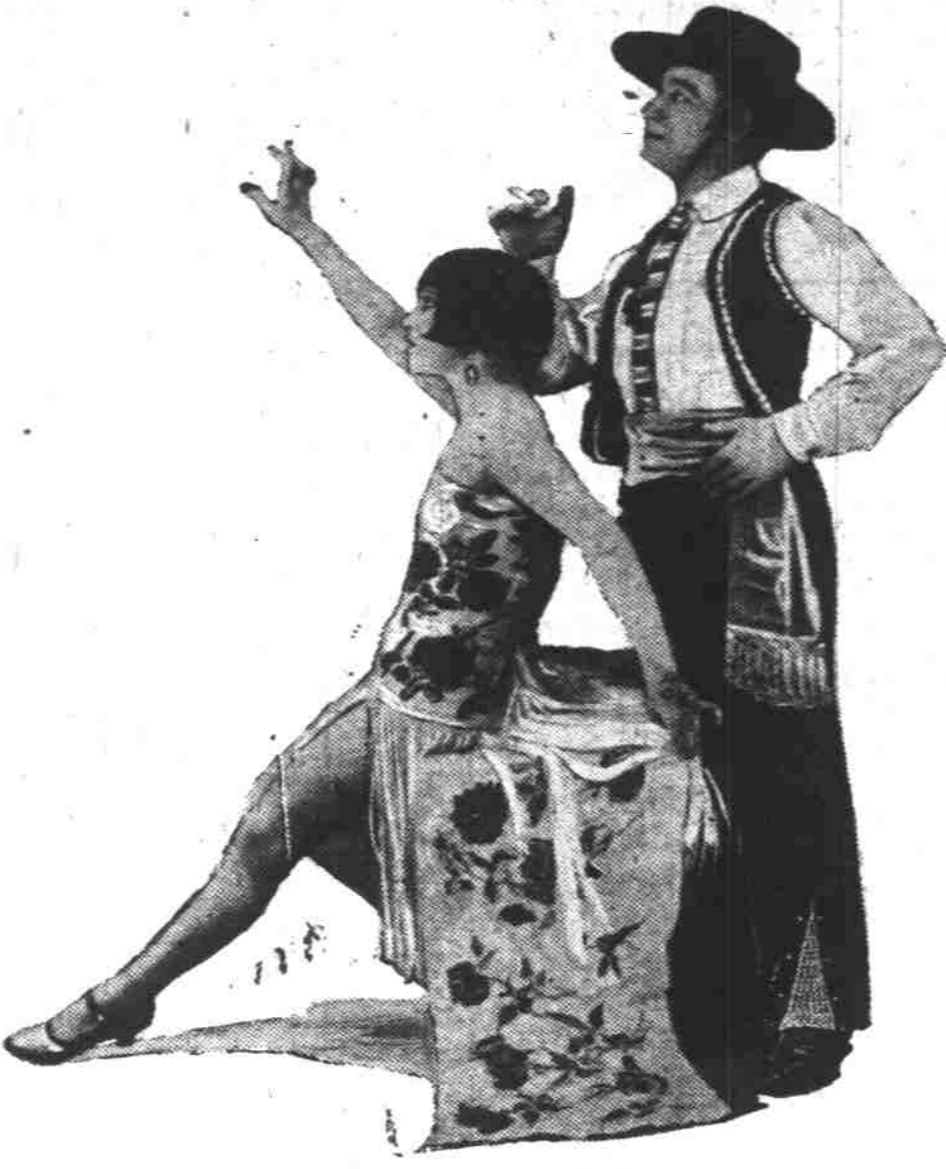
At Capitol Theater today