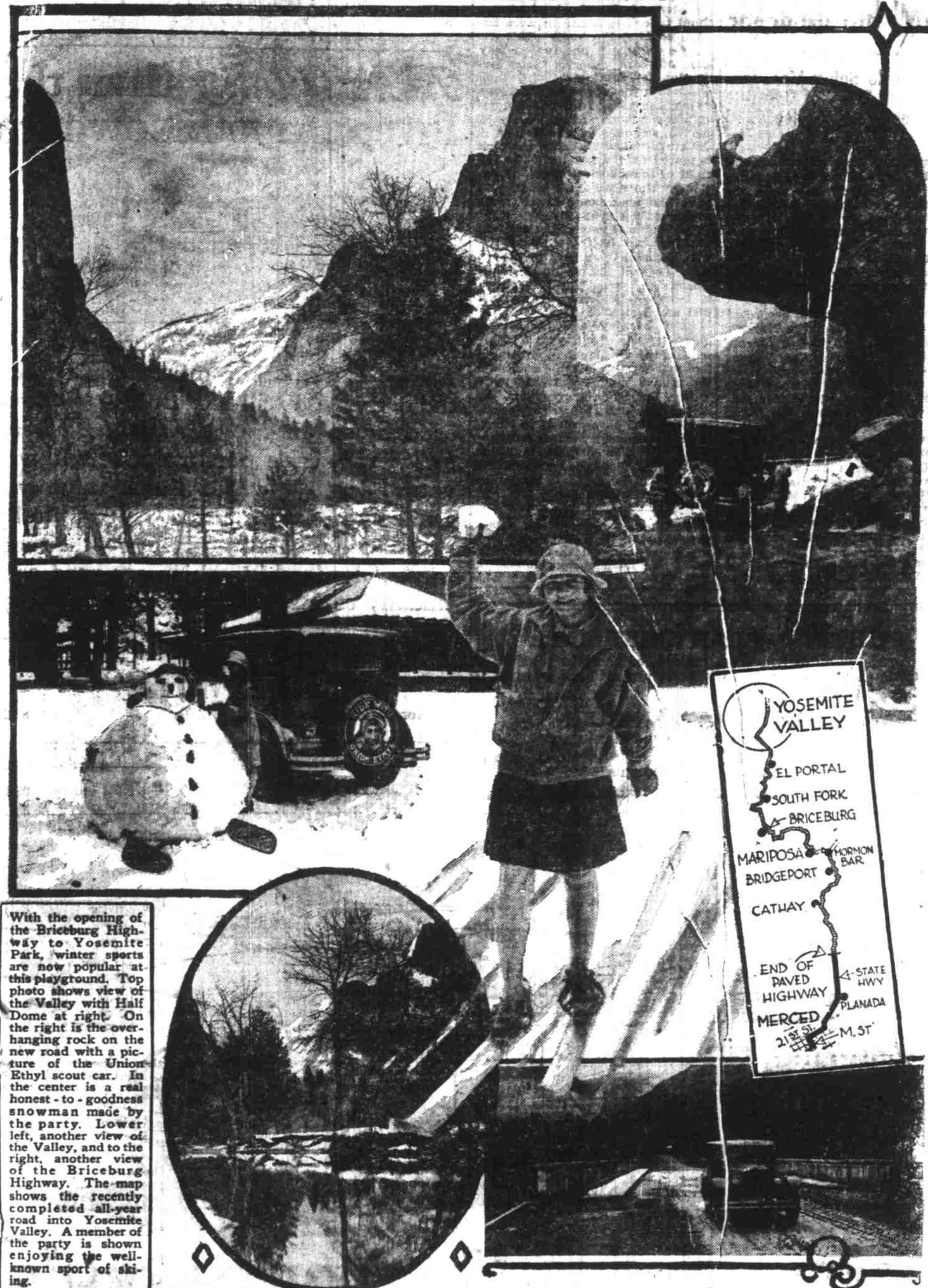
With the opening of the Bricburg Highway to Yosemite Park, winter sports are now popular at this playground. Top photo shows view of the Valley with Half Dome at right. On the right is the overhanging rock on the new road with a picture of the Union Ethyl scout car. In the center is a real honest-to-goodness snowman made by the party. Lower left, another view of the Valley, and to the right, another view of the Bricburg Highway. The map shows the recently completed all-year road into Yosemite Valley. A member of the party is shown enjoying the well-known sport of skiing.