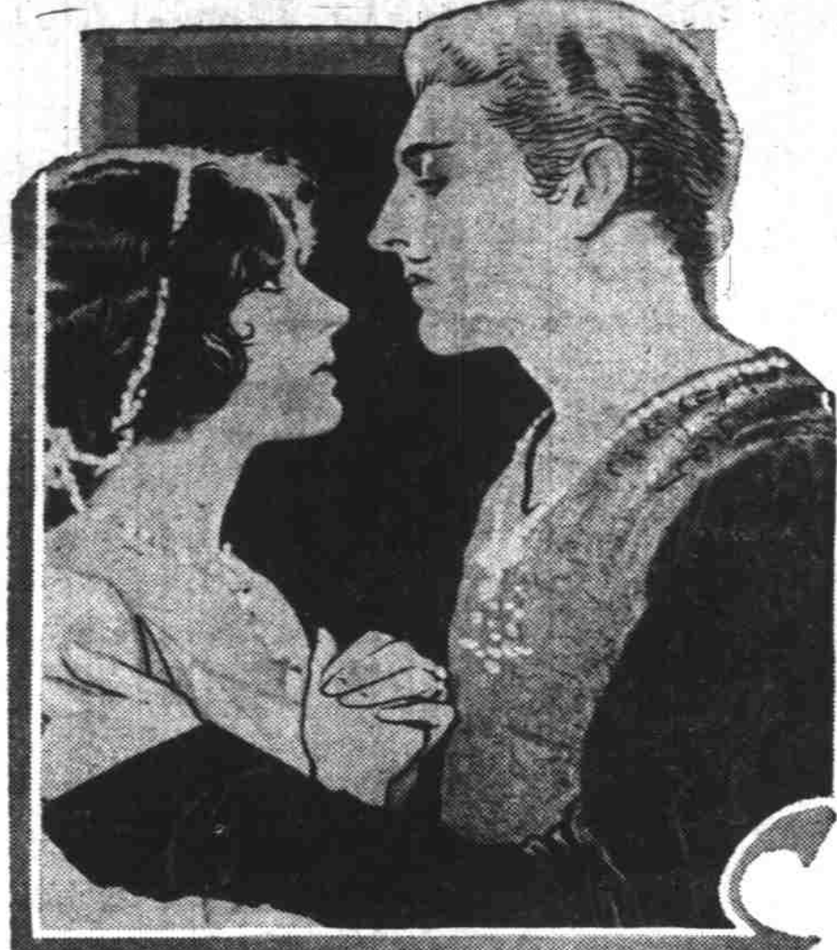
Scene from JOHN BARRYMORE in "THE BELOVED ROGUE"