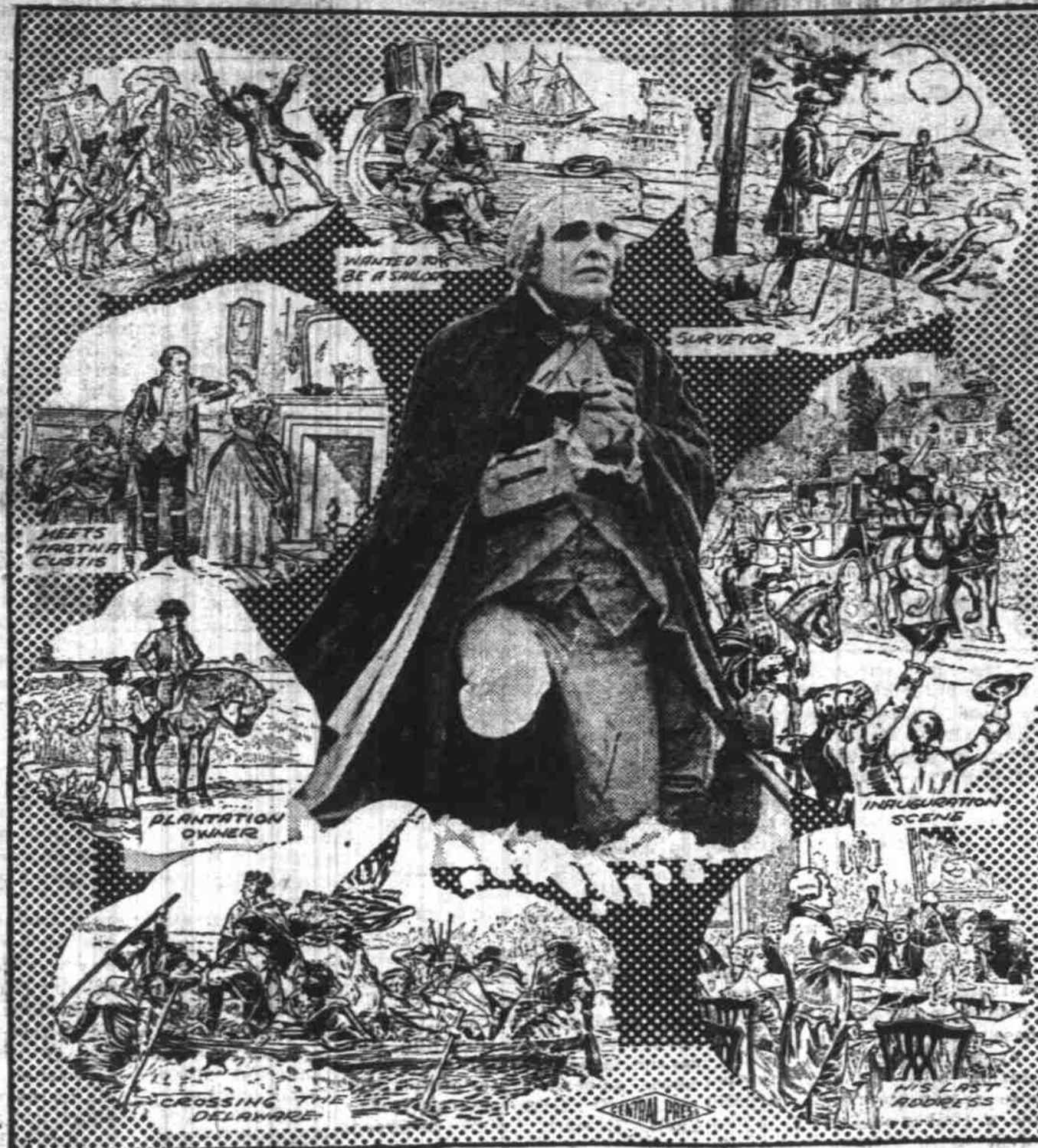
The Picture of Washington Shows Him Praying at Valley Forge

improving the caliber of statesmanship under the bronze dome, The Statesman is going to be for the proposition. Not that we have not had fine samples of lofty statesmanship under the former meager pay; but there is need for a greater proportion of such samples among the whole body of ninety law makers.