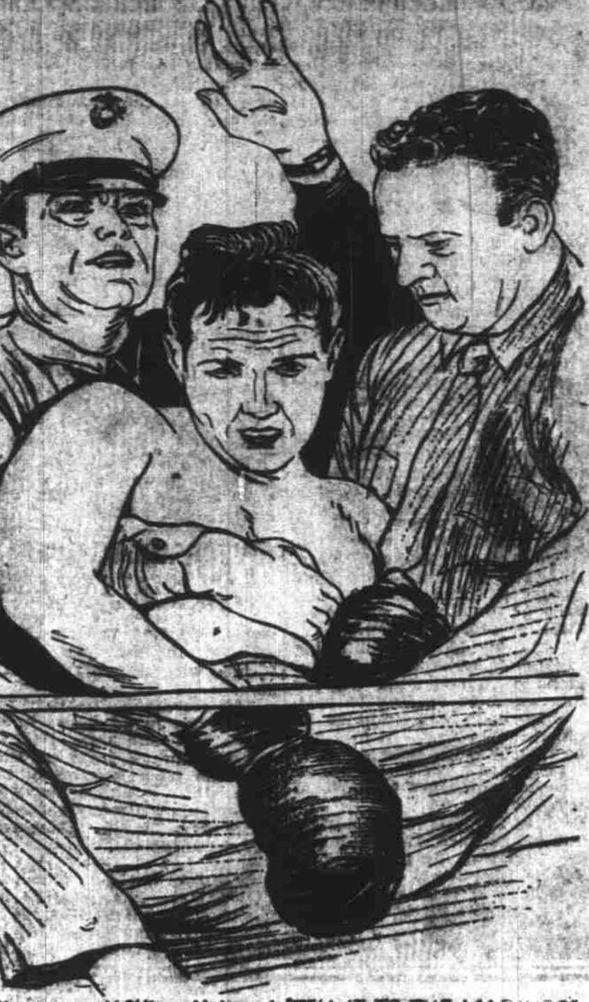
Lon Chaney and William Haines in "TELL IT TO THE MARINES"

ing PEO members who are in the city are invited to attend.