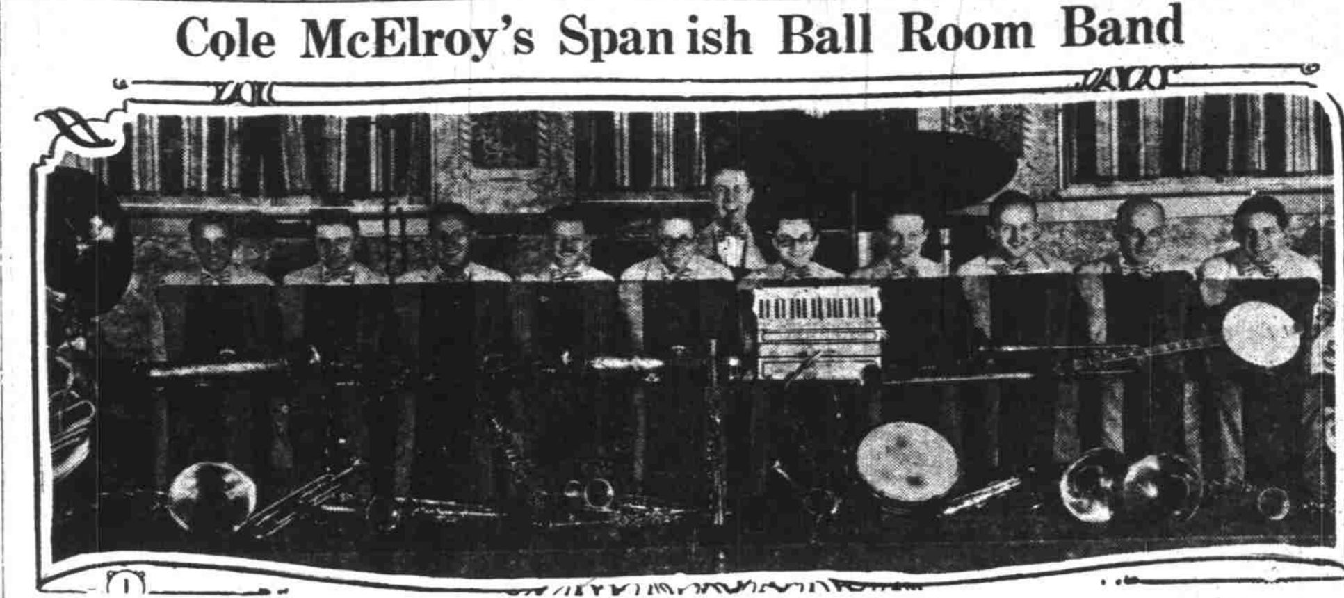
Famous band to appear at Elsinore theater this afternoon