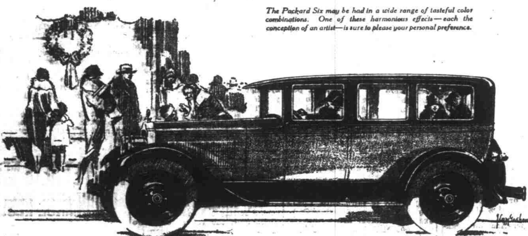
The Packard Six may be had in a wide range of tasteful color combinations. One of these harmonious effects—each the conception of an artist—is sure to please your personal preference.