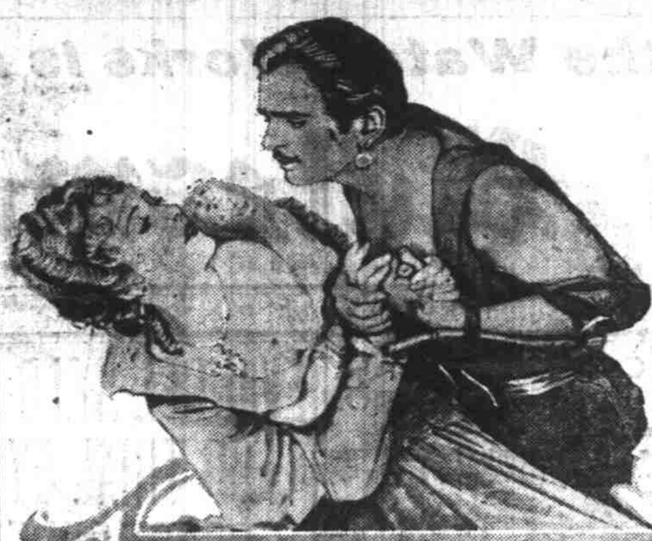
Douglas Fairbanks in "The Black Pirate"