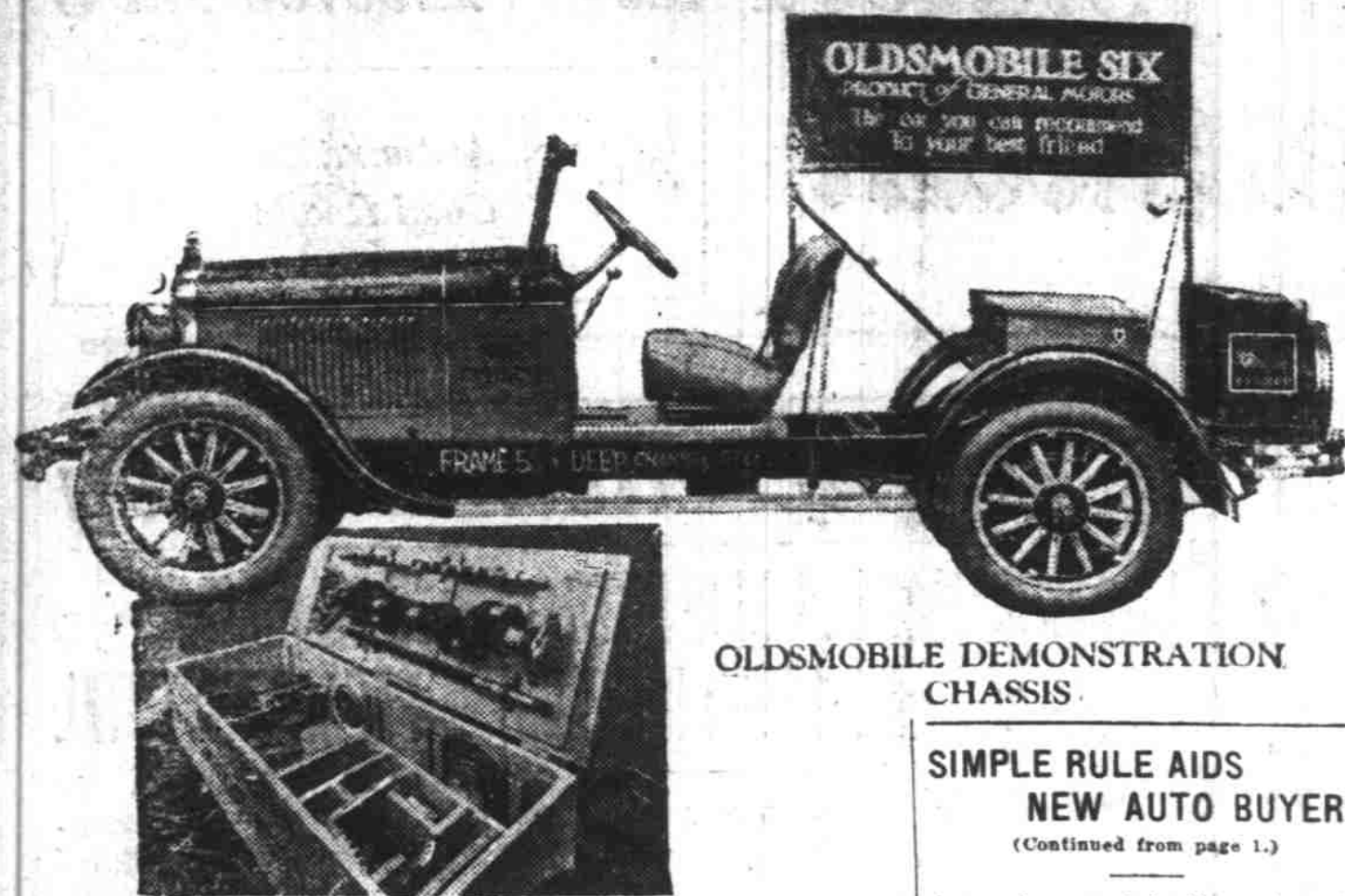
OLDSMOBILE DEMONSTRATION CHASSIS