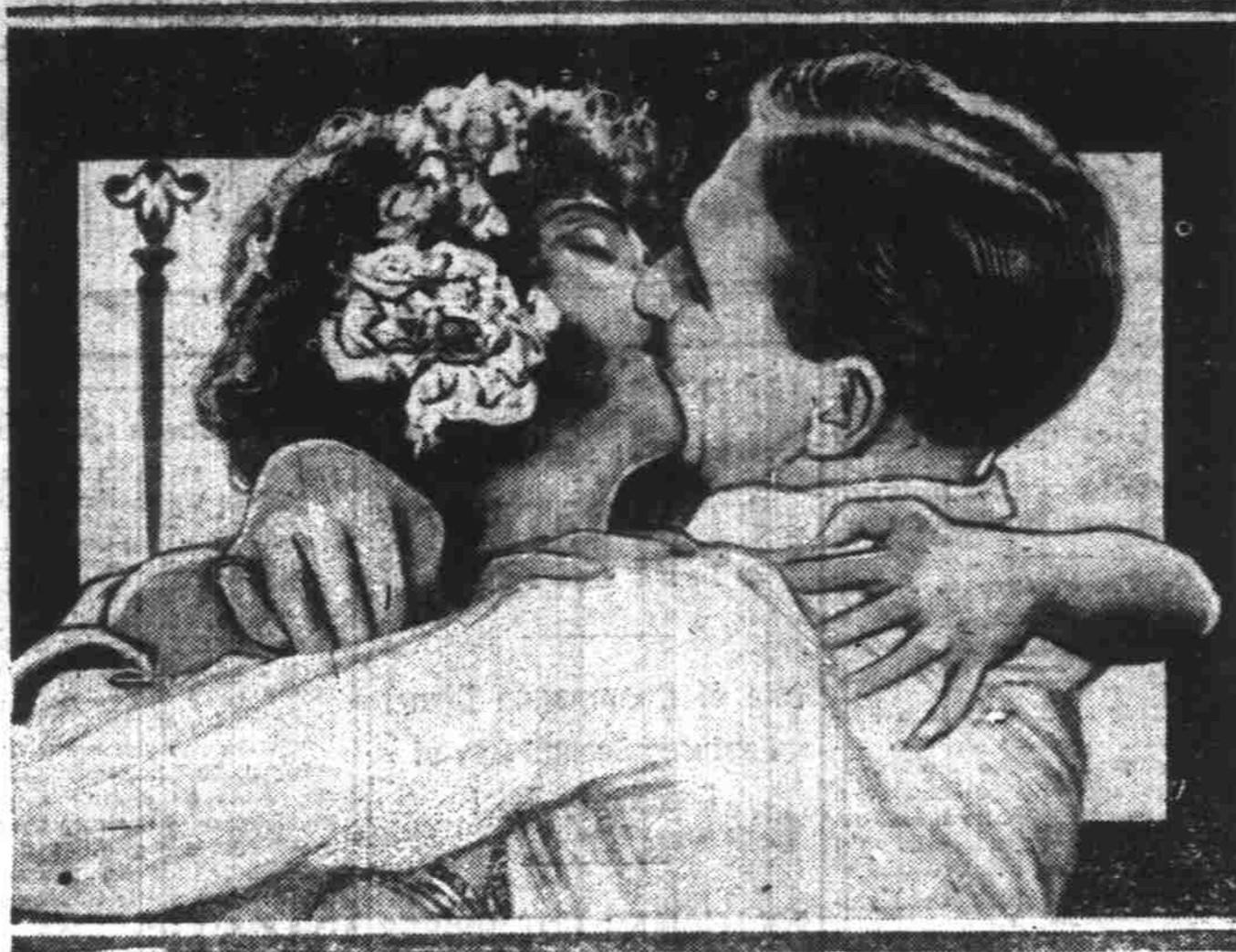
Gilda Gray in "Aloma of the South Seas" at Elsinore