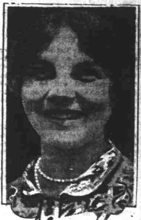
This most recent photo of Helen Willis, an unusual one because she is without her famous eye shade, shows her smiling despite her inability to defend her national tennis title, for which Miss Elizabeth Ryan and Mrs. Molla Bjurstedt Mallory met.