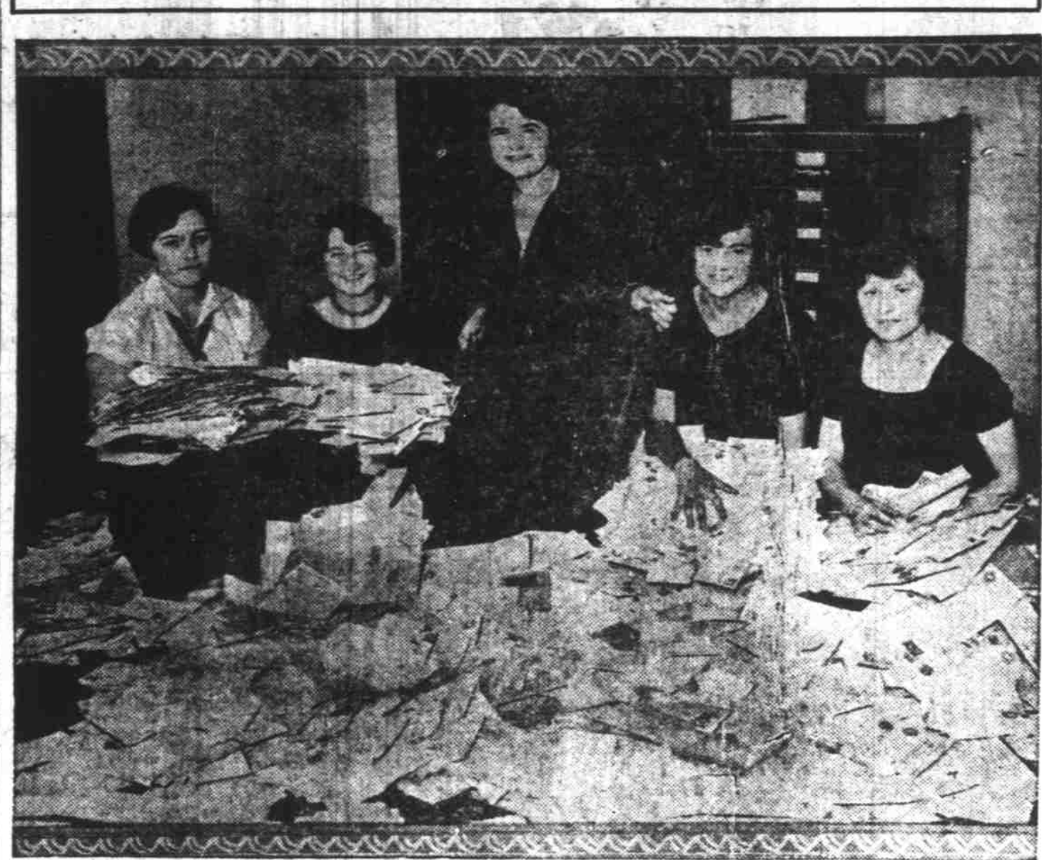
This bevy of girls is only part of the small army that is looking after the thousands of names that are being suggested for the General Petroleum Corporation's new General Mystery (2) Gasoline. It is estimated that more than 100,000 names will be received before the contest ends August 31. Each name is carefully listed on an individual card, so that the judges may check each one.