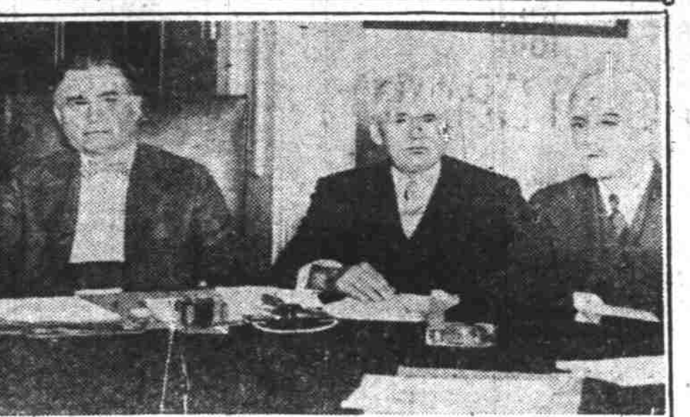
For the last time until congress reconvenes next fall, the "Big Four" of the Foreign Commission meet to discuss international problems which have arisen since the adjournment of congress. Seen here, the four are, left to right: Secretary Hoover, Senator Borah (chairman), Secretary Kellogg and Secretary Mellon.