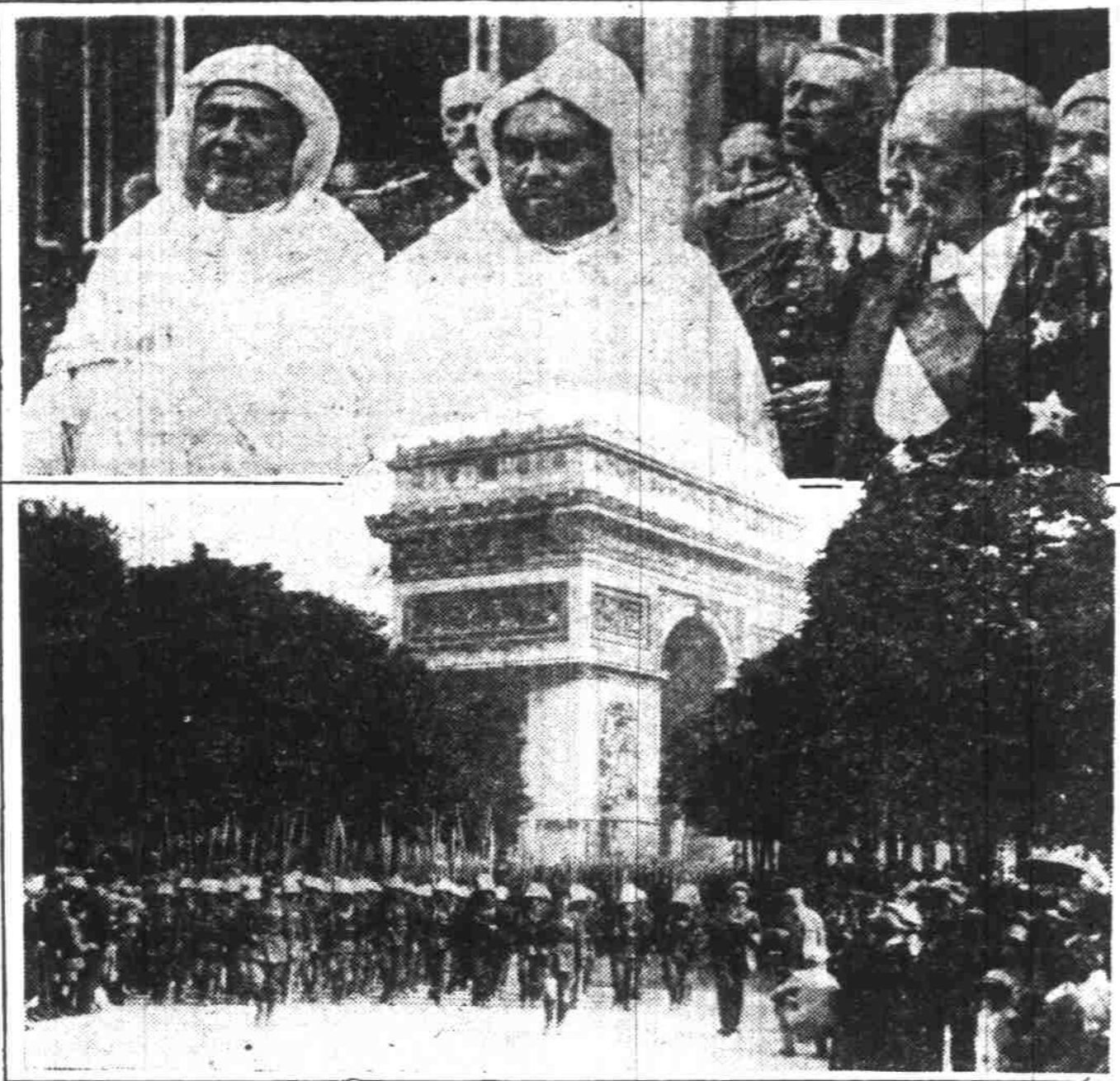
With parades and display more elaborate than any since the peace celebration in 1918, and forgetting its financial chaos, Paris observes Bastille Day and the culmination of peace in Morocco. The photos show parading troops with the Arch of Triumph in the background, and the members of the Moroccan peace delegation, left to right: Si Chami Abadon, Moulay Youssef Sultan, of Morocco, and M. Steeg, governor of Morocco.