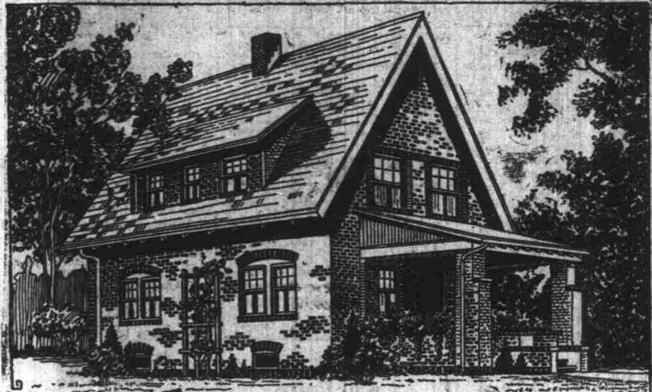
THE SUSQUEHANNA, DESIGN NO. 111

ECONOMY seems to have been the inspiration in the designing of this exceptional little home. Not only economy in cost but economy in effort for the busy housewife, features which carry a double appeal. More of living comfort is provided in its limited dimensions than in any house we have offered in many weeks. In its ideal interior arrangement not a foot of space has been wasted. Compactness and convenience have been combined most happily throughout, and none of the features of the up-to-date small home are missing. In every particular it is very complete.