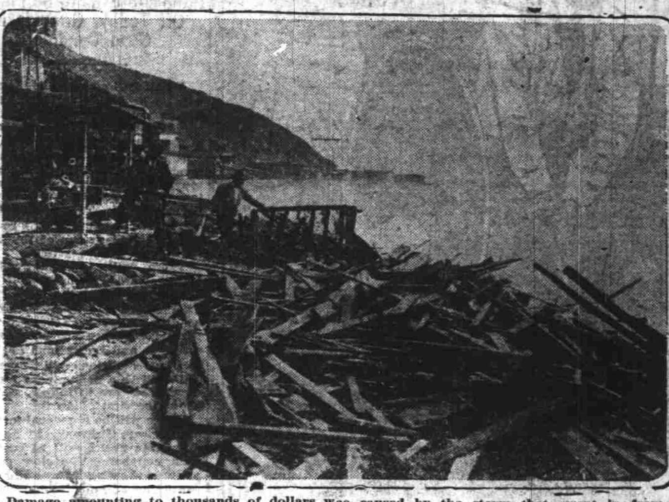
unting to thousands of dollars was caused by the storm that swept in from the Pacific Ocean, weeking houses and damaging piers from Inceville to Palisades Del Rey, in the Santa Monica Bay district. Photo shows a part of the wreckage that was strewn along the shore for a distance of several miles. A thousand miles of coast line was racked by the tremendous offshore winds that roared down both the mid-Pacific and North Pacific steamer lines .