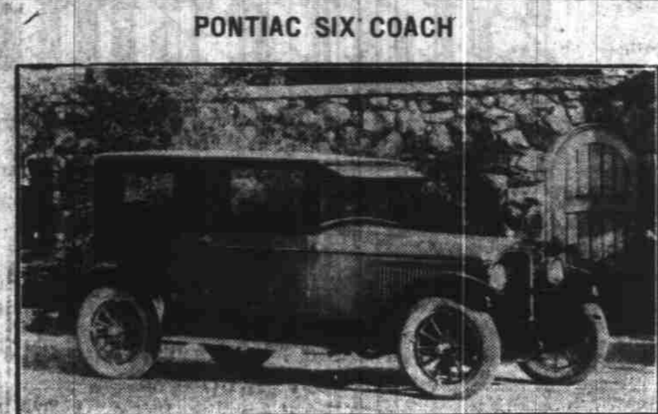
PONTIAC SIX COACH

BASKETBALL SCORES At Missoula: University of Oregon 35; University of Montana 17. At Newberg—Linfield college, 39; Pacific college 33. At Corvallis—OAC 27; Whitman 21.