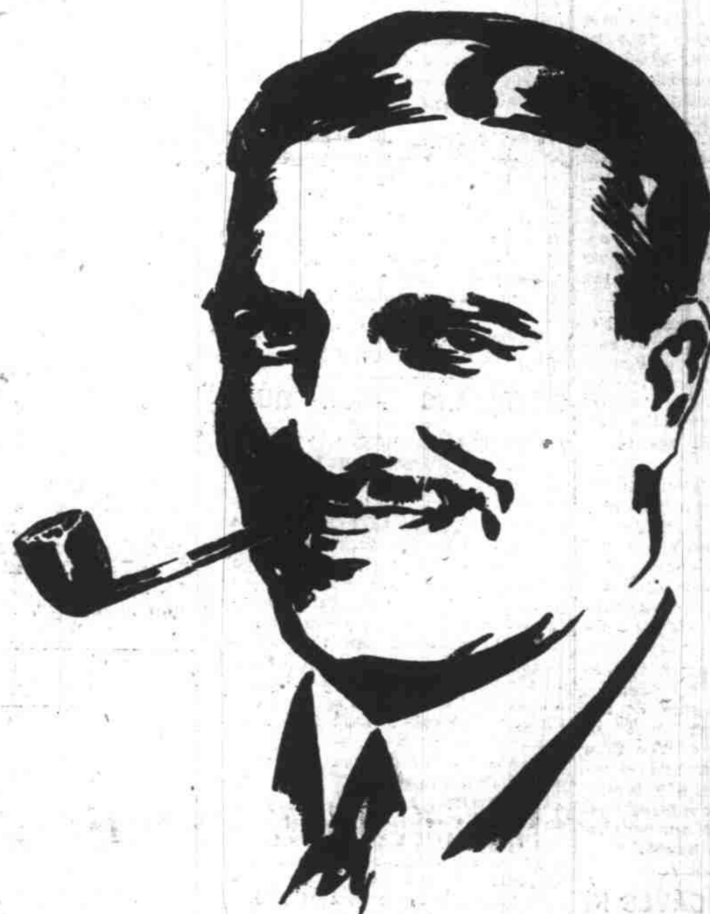
P. A. is sold everywhere in tidy red tins, pound and half-pound tin tins, and round crystal glass tins, with sponge-moistener top. And always with every bit of nice and perch removed by the Prince Albert process.