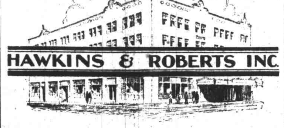
HAWKINS & ROBERTS INC.

MORTGAGE LOANS 2nd Floor, OREGON BLDG BONDS AND SALEM, OREGON INVESTMENTS