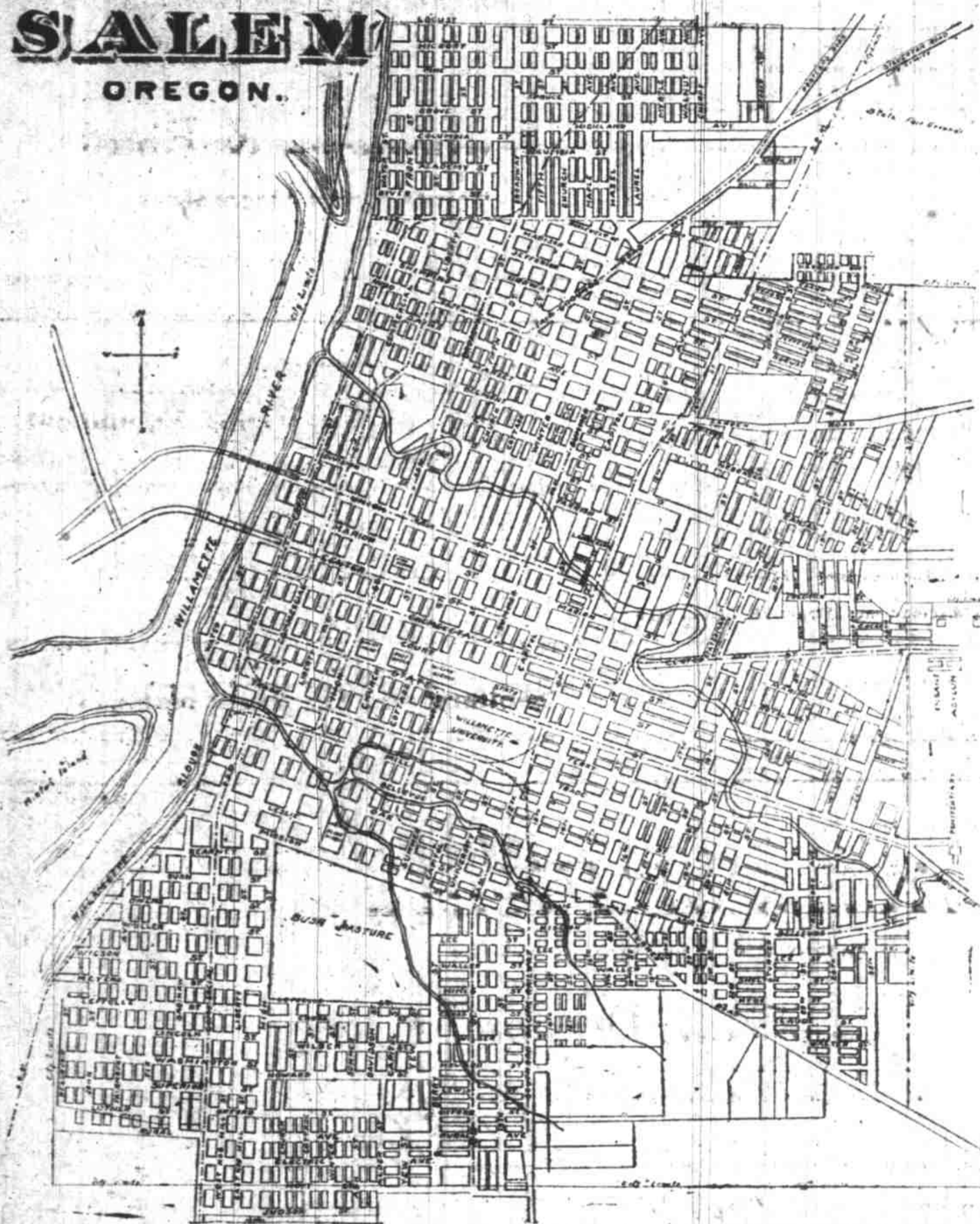
DETAIL MAP OF SALEM, OREGON

are held in the Willson park twice a week in the summertime. There are many places of interest in and around Salem that I like to see, and take my friends to see when they come to visit me. Among these are the state hospital and grounds, the state house and penitentiary and their grounds, the pheasants in a cage near the penitentiary, the blind school, the deaf school, and the tuberculosis hospital. I like to live in Salem because the state fair is held here every year and it is both entertaining and helpful. I like to live in Salem so well that I know I possibly couldn't get it all in 250 words. I hope I may live in Salem un- (Continued on page 6.)