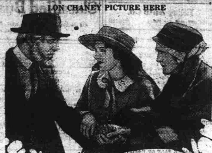
LON CHANEY PICTURE HERE

That wonderful character artist, Lon Chaney, is now playing at the Heilig theatre in "The Tower of Lies," said to be one of his greatest pictures and one in which he appears in a remarkable makeup. "The Tower of Lies" will be shown at the Heilig today, Sunday, Monday and Tuesday.