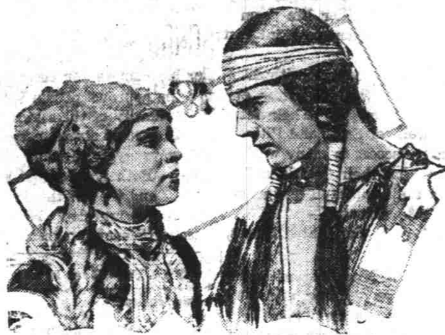
Shown above are Clara Bow and Robert Frazier in "The Scarlet West," a tale of the conquest of America's western empire. The drama is well-wrought and carries a powerful theme. It will start at the Oregon theatre today.

of the educational profession, as well as some teachers claim that the courses of study have been too widely extended, covering too many subjects, so that under the present system it is impossible for the most conscientious teacher to give the drill necessary to make students well grounded in the fundamental branches.