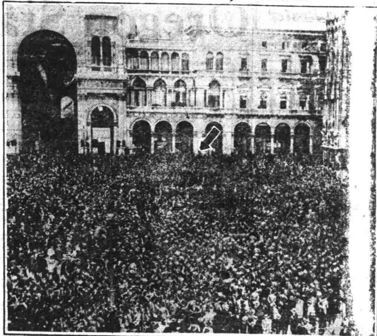
A view of the great crowd which gathered to hear "Il Benito"—Mussolini, prime minister, minister of war, foreign minister and dictator of all Italy, speak at a Fascist meeting in Rome. Mussolini (arrow) with his power growing daily, has thrust the king into the background, and is emerging as a modern Caesar.