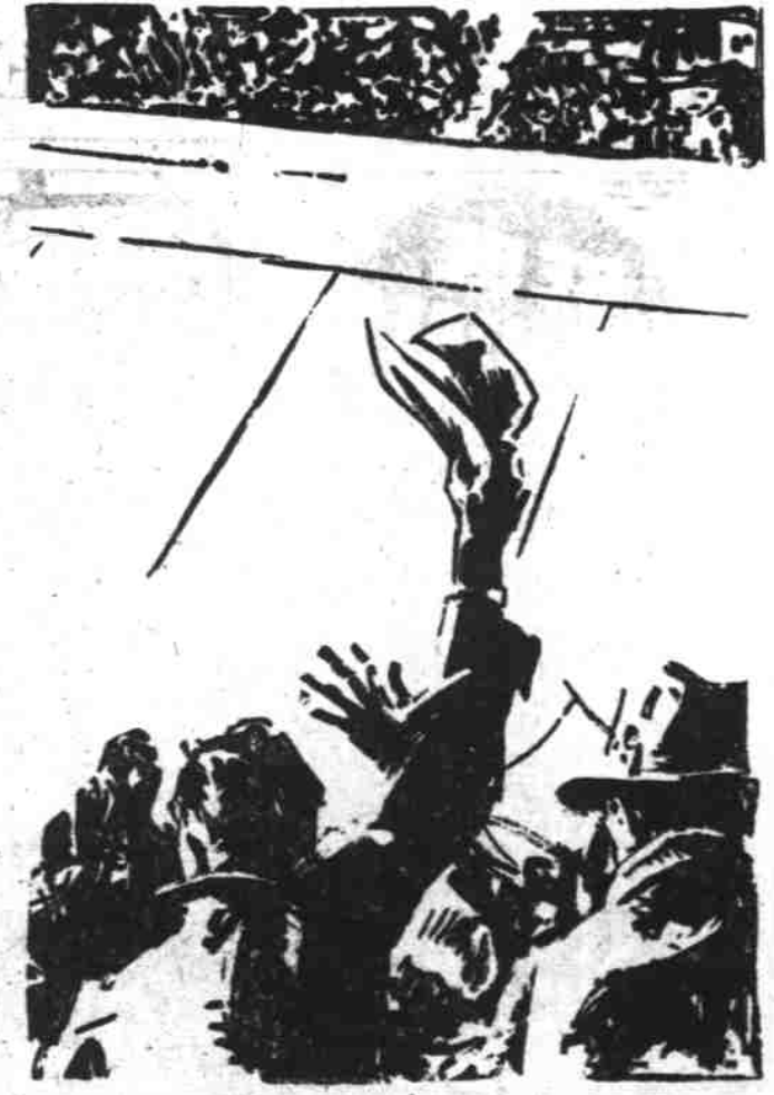
Our highest wish, if you do not yet know Camel quality, is that you try them. We invite you to compare Camels with any cigarette made at any price. R. J. Reynolds Tobacco Co.